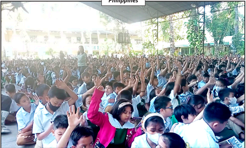
High schoolers in the Philippines reading Chick tracts