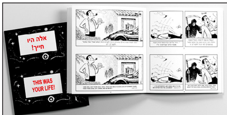
Dual-language "This Was Your Life" in Hebrew and English