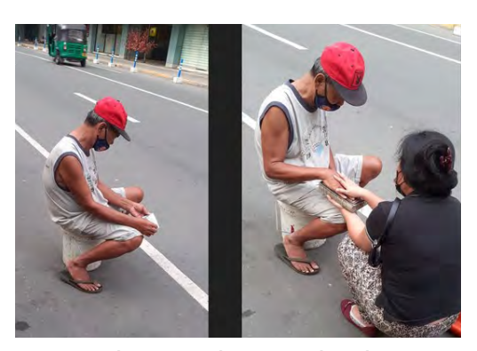
Read a tract . . . then pray. That's how it's supposed to work, right?

One pastor reports: "I am able to discuss with youth ages 13 and above regarding what is inside the Gospel tracts. By God's grace there are 13 souls who received Jesus as their Lord and Saviour."