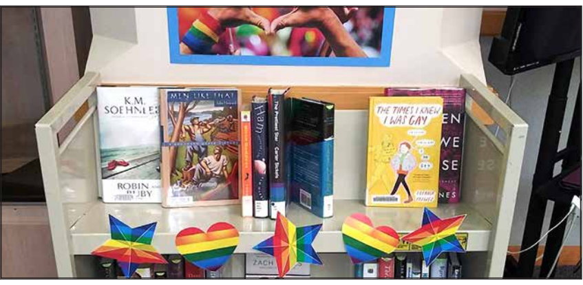
A Google search of some of the titles visible here will show the depth of the perversion.

Beloved, America needs Jesus. And the only way they can really know Him is through the power of His word. Chick tracts are heavily laced with Biblical truth. We just need to get more of them out there where people can read them.