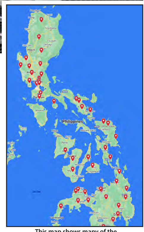
This map shows many of the destinations for these tracts. Workers are waiting!